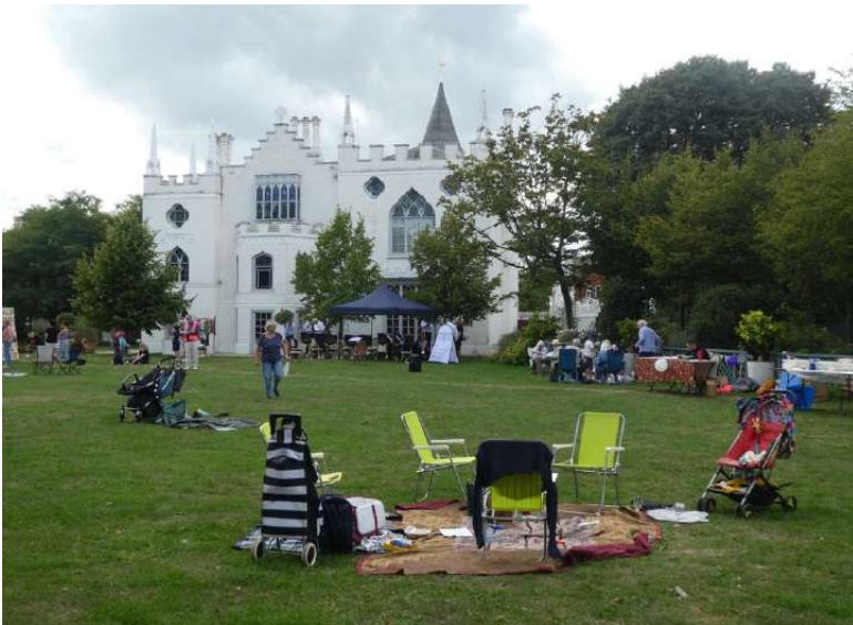
The Big Family Picnic

We are pleased to report that following the publication of the fourth, fully revised and updated edition of our local history book, Strawberry Hill: A History of the Neighbourhood , we have only 100 left from our 250 print run. We can still deliver copies to your door in Strawberry Hill for £8 – an ideal Christmas present.