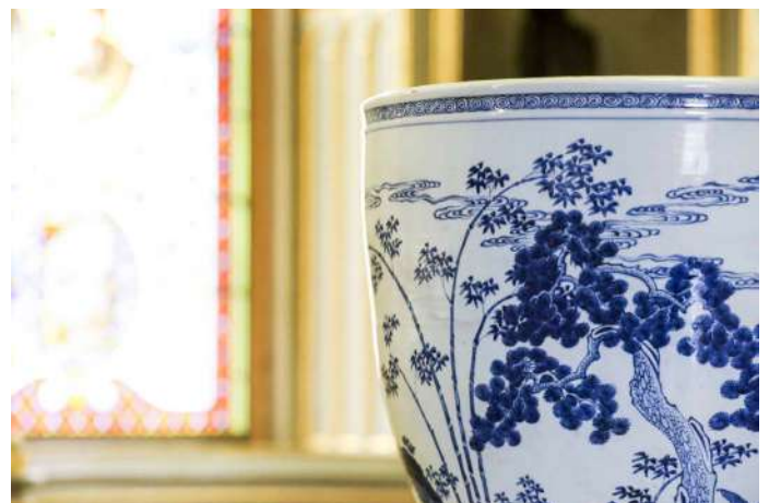
The Goldfish Bowl

After 1778 the tub was moved to the Little Cloister, outside of the