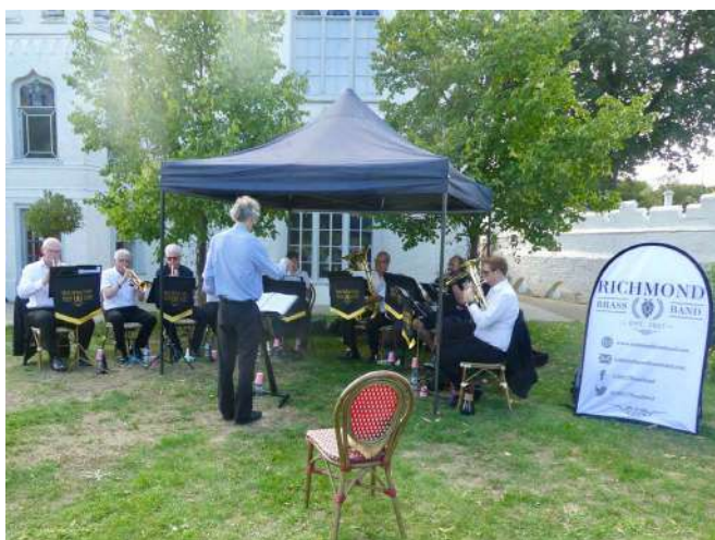
Richmond Brass Band