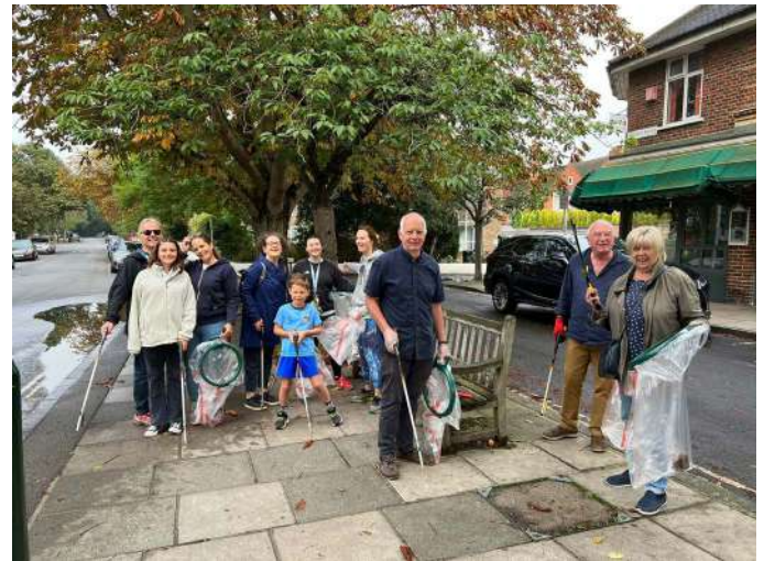
Litter Pick Team

We have advertised the litter picks on the SHRA noticeboard at Strawberry Hill Station and in shops in Tower Road. We have extended the litter picking posters to St Mary's University to encourage some students to join us in cleaning up the neighbourhood. We advise those joining us to beware of the traffic, as it is easy to be carried away looking down and lose sight of where you are in relation to the road. SHRA does have public-liability insurance which helps protect our volunteers.