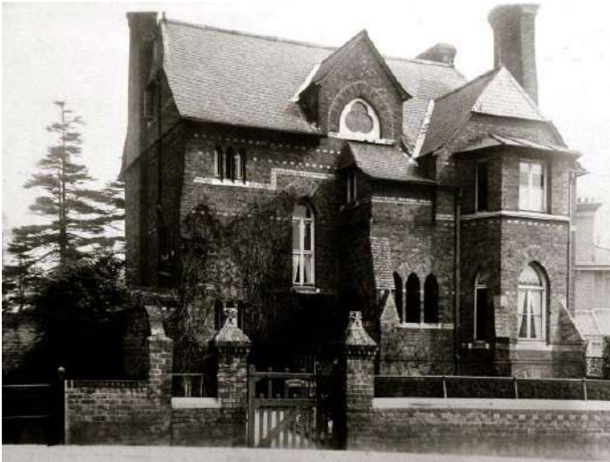
Thornton Lodge in 1930