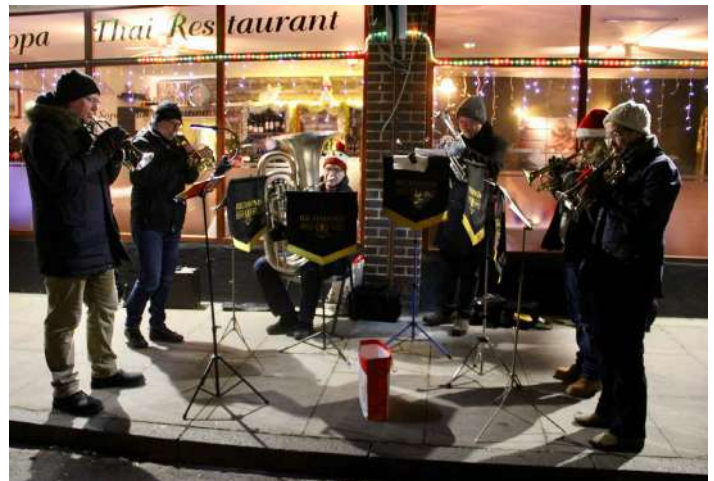
SHRA Carols and the Brass Band - Christmas 2021