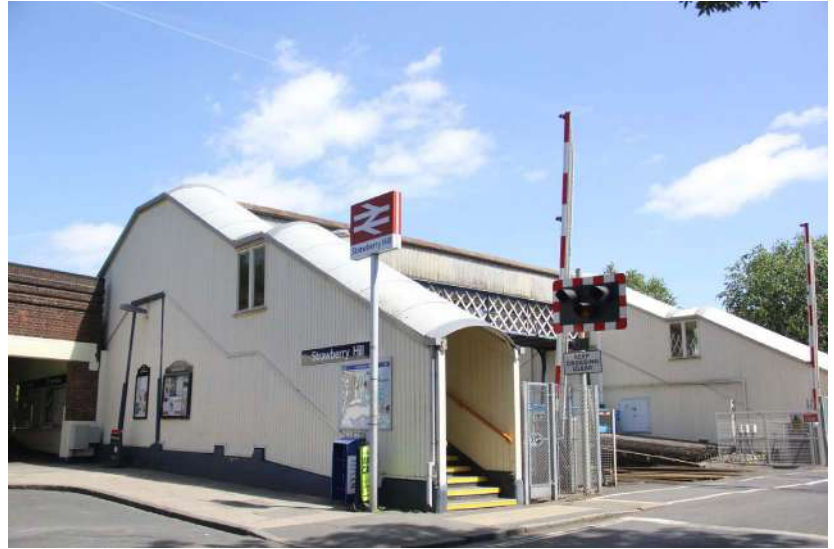
Strawberry Hill Station - Adopt a Station Scheme