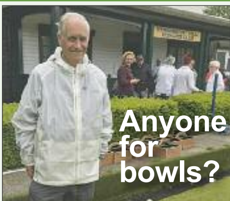
Strawberry Hill Bowling Club has been a fixture in the sporting scene of this area since it was founded in 1920. On Sunday 13 May, the Club

Annual membership costs £90 with a 50% reduction for new members. You can find more information on the website at: www.strawberryhillbowling.co.uk