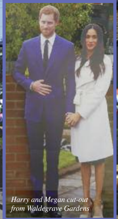
Harry and Megan cut-out from Waldegrave Gardens