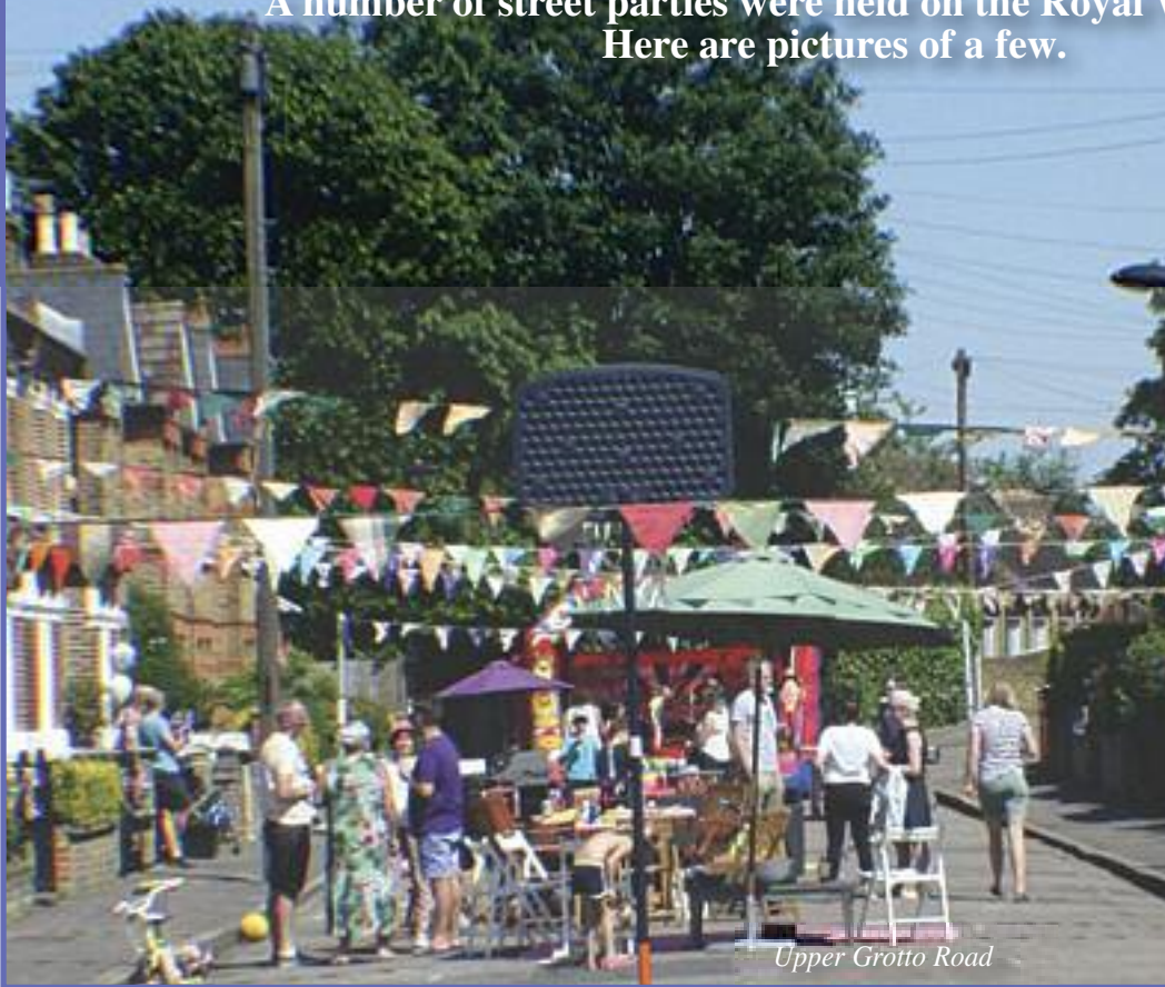
Upper Grotto Road

A number of street parties were held on the Royal Wedding Day. Here are pictures of a few.