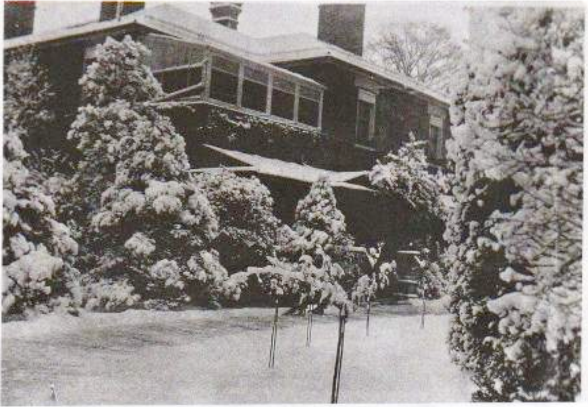
The Elms garden in the snow