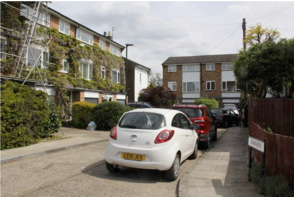
The Downside cul-de-sac showing the 1960s houses that were built on the site of The Elms