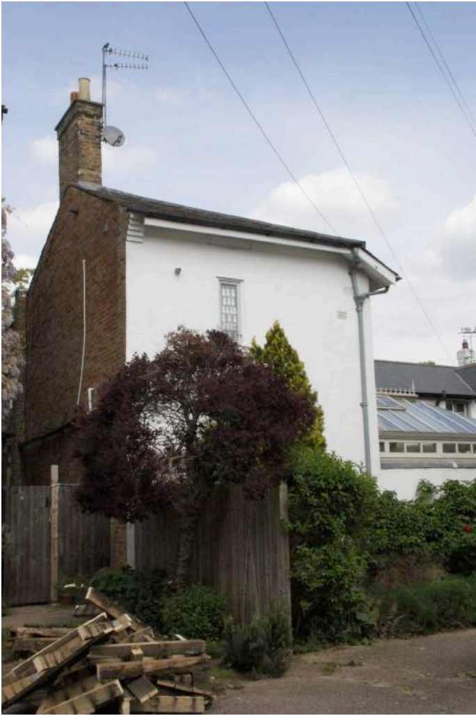
Rear view of No29 Tower Road aka what remains of The Elms from Downside