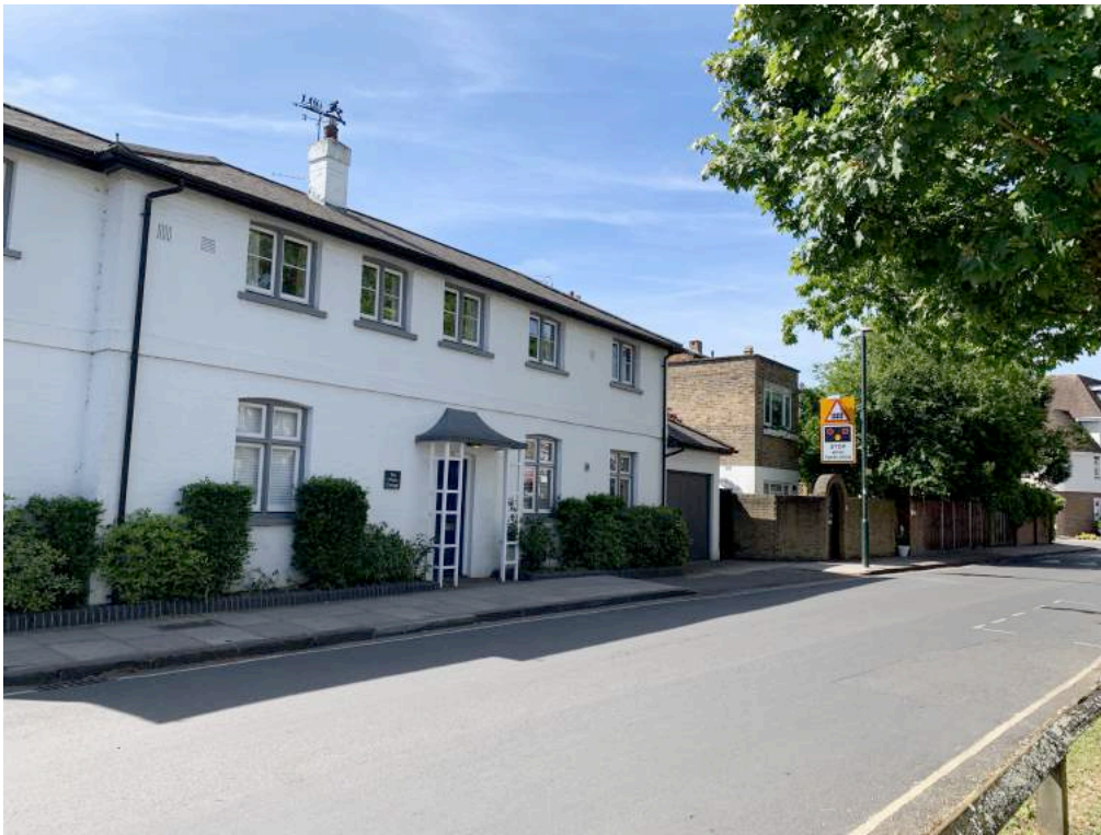
No.27 Tower Road – The Stables , The White Lodge now, The White Cottage