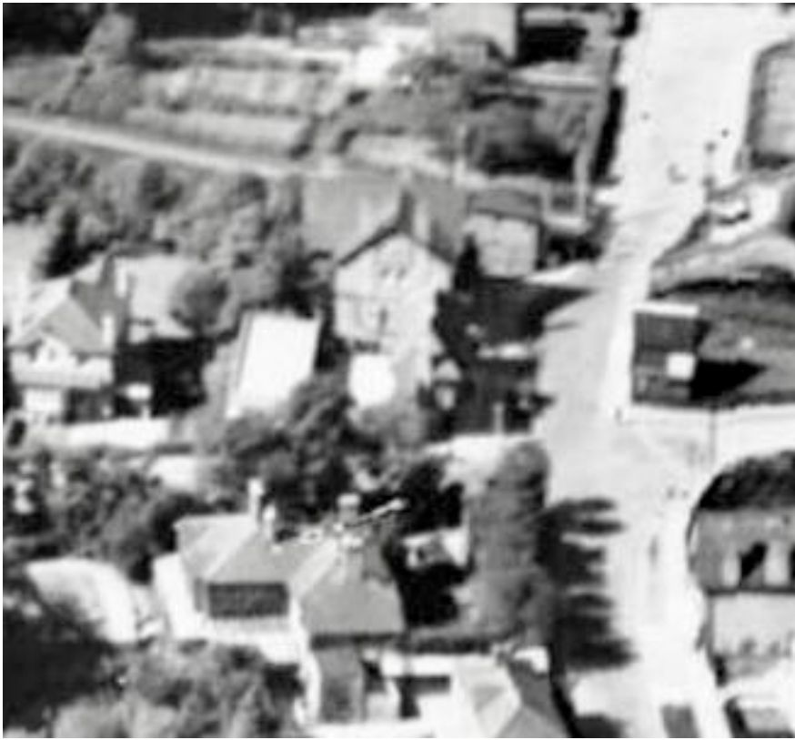
Roofs and veranda of The Elms and The Stables can be seen in the foreground of this 1928 aerial view of the Tower Road/railway intersection