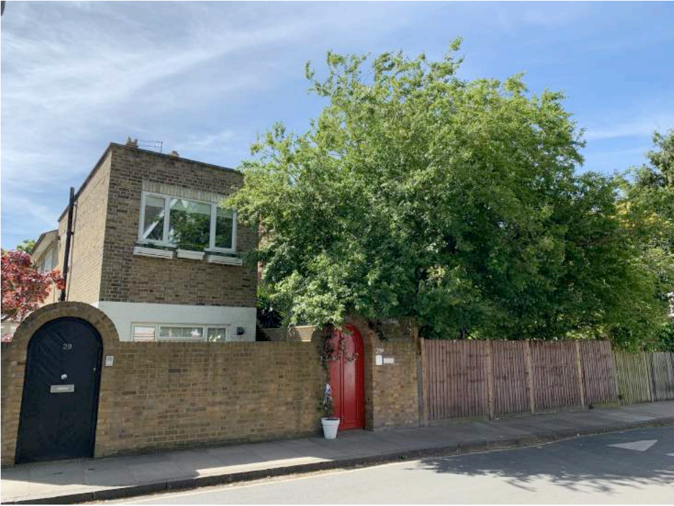
Part of The Elms which is now 29a Tower Road