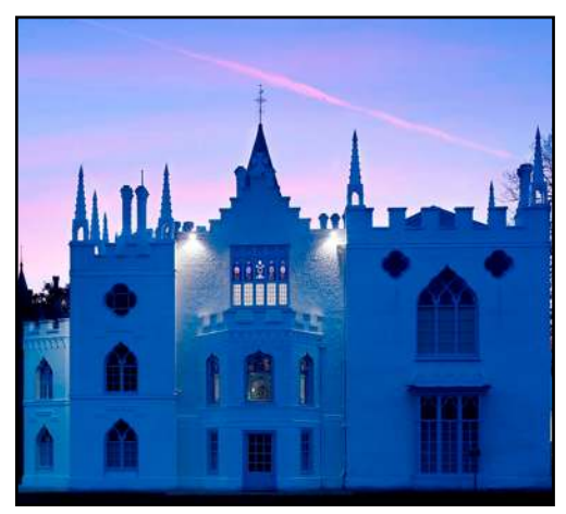
An evening view of the East Front (Kilian O'Sullivan)

"Her final, extremely happy marriage was sadly curtailed. All this is examined in The Last Great Lady .