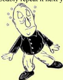
A resident leaves the Golf Club after the party

In a break with our usual format, drinks were provide for residents after the meeting. We were delighted to see residents making new acquaintances and chatting to old friends. Some were still there late in the evening. The event was so successful that we will probably repeat it next year.