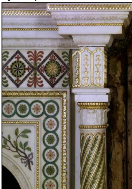
Robert Adam's scagliola fireplace in the Round Drawing Room.