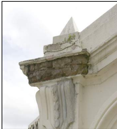
Damage to the Bath House (gazebo)

The grade 2 listed summer house and the gazebo, the oldest structures in the gardens, are in poor condition and demand work urgently. FoRG is pressing the Council for action.