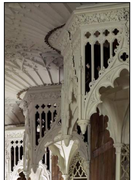
The Long Gallery

Whether you decide to volunteer with us, or to visit us later in the year, we look forward to welcoming you all and hope that you enjoy this fascinating house and garden as much as we do.