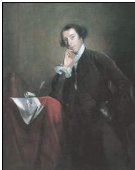
Joshua Reynolds' portrait of Horace Walpole

And finally, on 25th July St James's Church will celebrate its 125th anniversary.