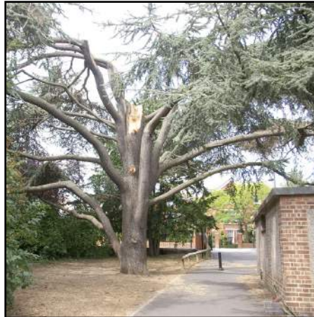
The cedar, looking the worse for wear, with the cafe on the right

The lovely old spreading cedar inside the south gate needed immediate surgery following a break in a branch near the top of the canopy. It will be monitored closely by the Council.