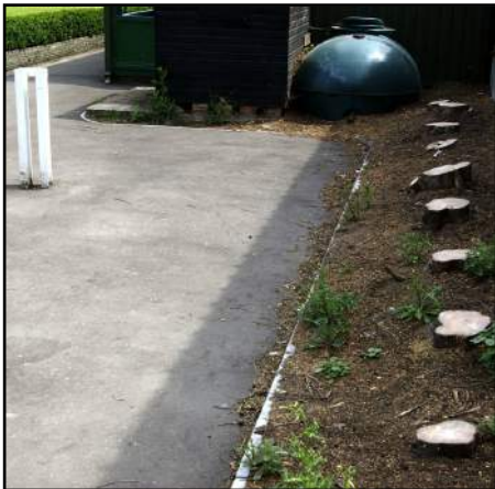
The cupressus stumps with the flagstaff base, unoccupied

Alas, the flagstaff, taken down during the tree removal, was stolen. The Council has promised to replace it.