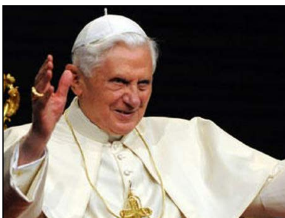
Pope Benedict XVI

Pope Benedict arrives at St Mary's University College on 17th September during a State Visit to Britain. He begins the day praying with representatives of religious congregations. He will then meet about 3,000 young people - schoolchildren and students - to celebrate Catholic education. From there he will then meet religious leaders and people of religious faith. He will discuss with them religion and belief in contemporary society.