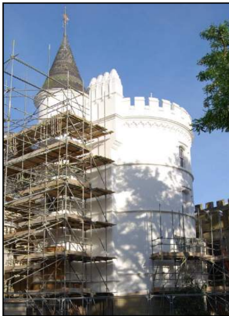
The Beauclerc Tower, now repainted in brilliant white.