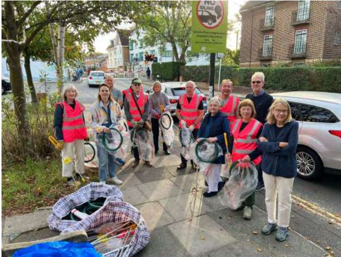
Members of SHRA litter-pick group