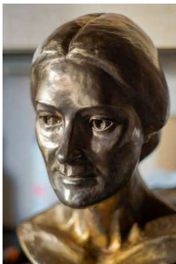
Bust of Lady Frances Waldegrave