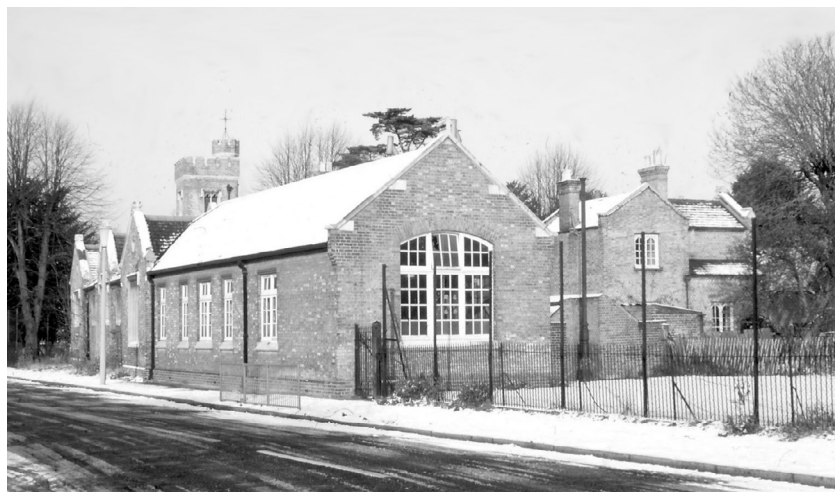
Archdeacon Cambridge School 1950s