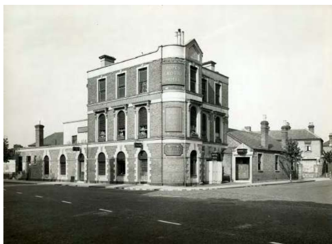
Pope's Grotto Hotel in the 1930s