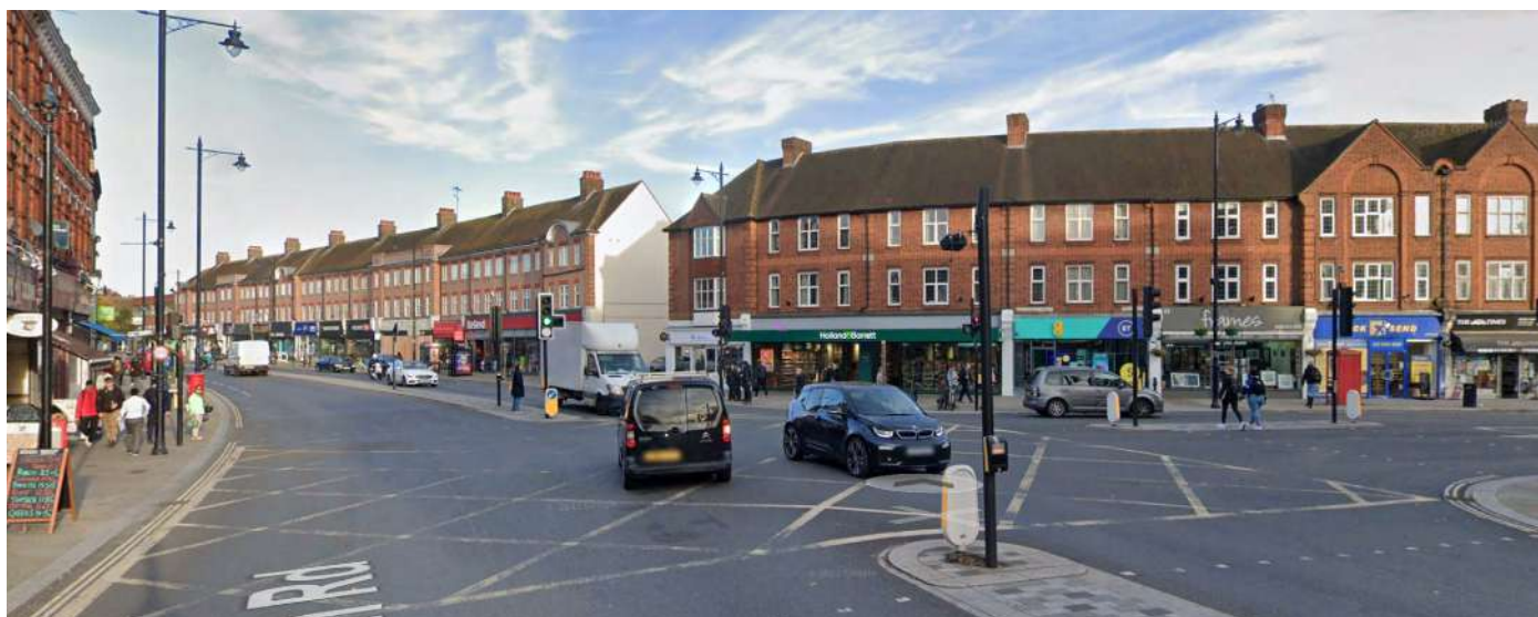
Cross Deep Junction with Heath Road & Kings Street

On 29 June the Council published an Order (Ref 23/110) to introduce a 20mph speed limit on the A310 Cross Deep and along Strawberry Vale to Hampton Wick. We also note that the long delayed works to improve the cycle corridor along this stretch of road were recently completed. These two measures should improve safety for pedestrians and cyclists in Cross Deep/Strawberry Vale.