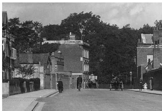
Cross Deep with The Pope's Grotto Hotel in the distance

The postcard dating from around 1910 shows the original name 'The Grotto Hotel' in the stonework above the second storey and the name Pope's Grotto Hotel on the sign on the corner at ground-floor level. The bust on the roof is that of Admiral Lord Nelson, the hero of the Battle of Trafalgar. Ewington's name is prominently displayed on the upper floor stonework – on the photograph looking north up Cross Deep towards Twickenham.