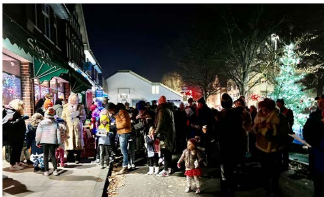
Carols in the Village - Christmas 2022