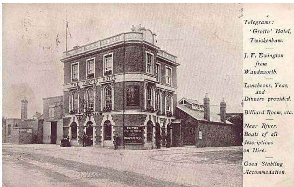
The Pope's Grotto Hotel c. 1910

In 1905, Twickenham Rugby Football Club made the Pope's Grotto Hotel their headquarters following their move to the Tower Road ground – 'a fine level piece of turf' - where they played until the start of World War 1.