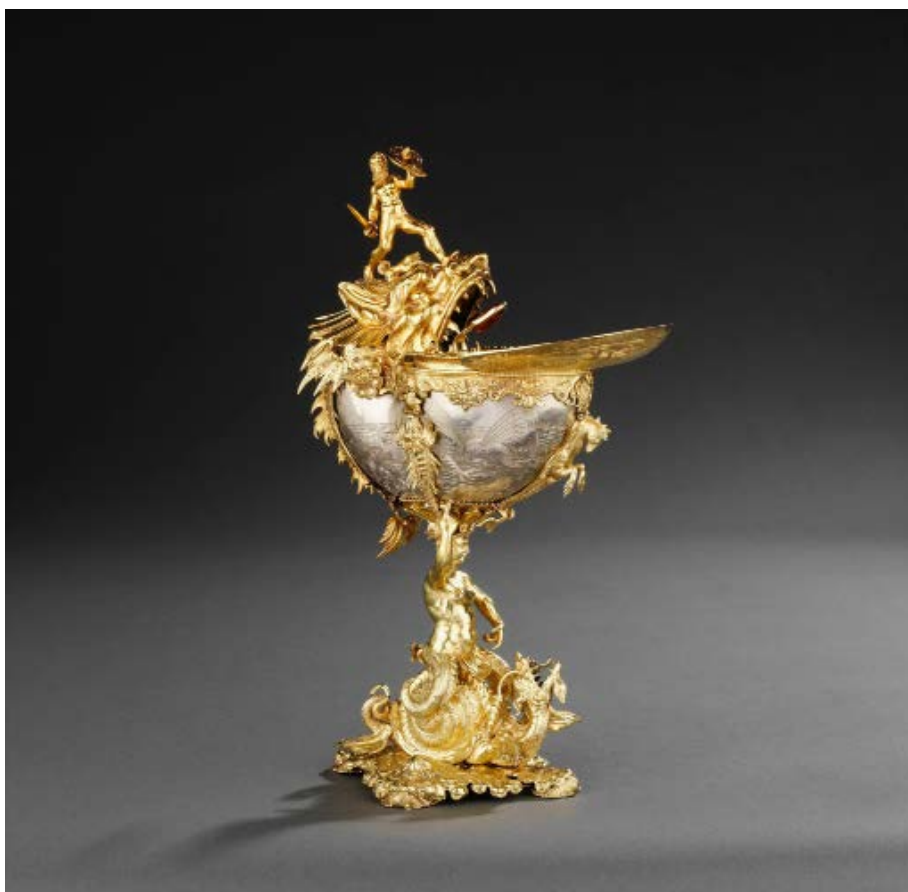
Nautilus Cup [Clementine Edney] Silver, parcel-gilt, nautilus shell and garnet. South Netherlands (Delft), 1595. The Schroder Collection.

strawberryhillhouse.org.uk/treasures-from-faraway