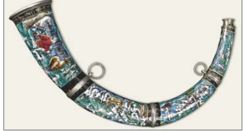
Hunting Horn Léonard Limousin (c1505 – 1575/7), 1538 Copper, painted enamel and cow's horn, 30,5cm length

Private Collection