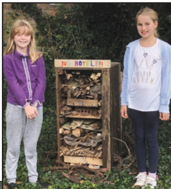
← Two children from the estate with their Bug Hotel.

'We'll be entering once again under the Estates category,' says Christine 'but we'd really like to see Strawberry Hill residents and businesses as a whole step up to the plate and "Go for Gold" in the Villages section. Let's bring up the visual appeal of our fantastic area still further'.