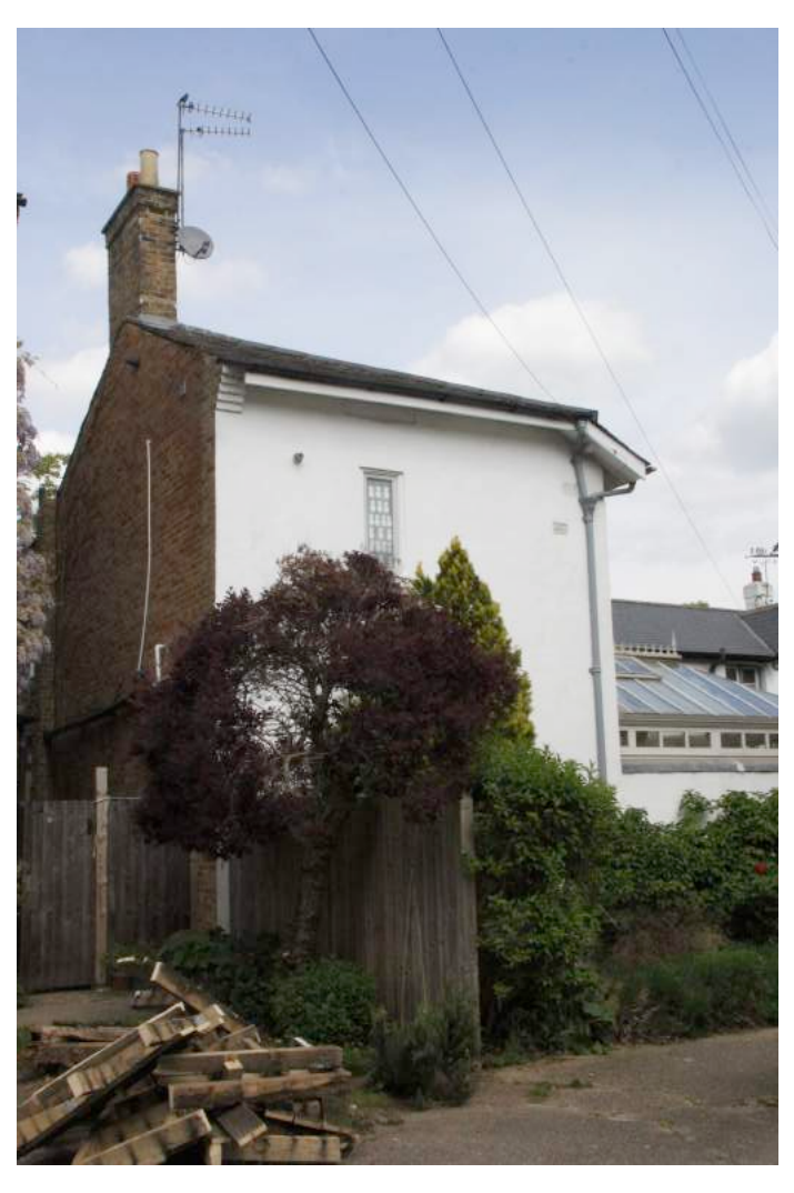
Rear view of No29 Tower Road aka what remains of The Elms from Downside