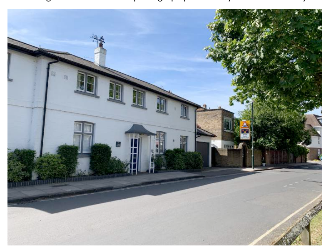
No.27 Tower Road – The Stables, The White Lodge now, The White Cottage