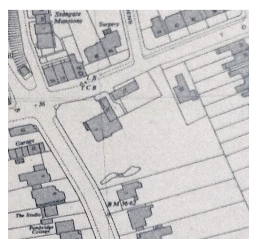
The Elms shown on the 1960 OS map