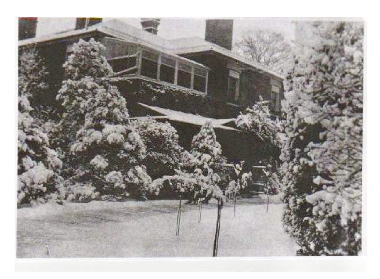
The Elms garden in the snow