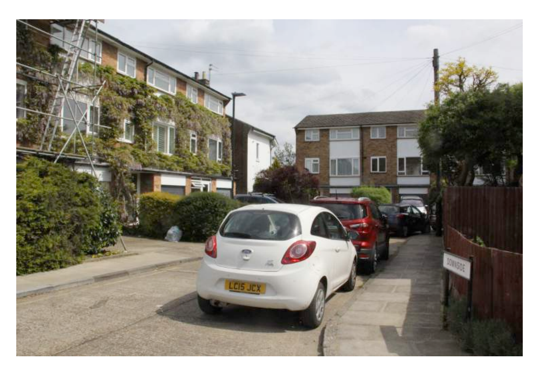
The Downside cul-de-sac showing the 1960s houses that were built on the site of \it The Elms