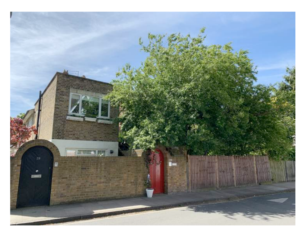
Part of The Elms which is now 29a Tower Road