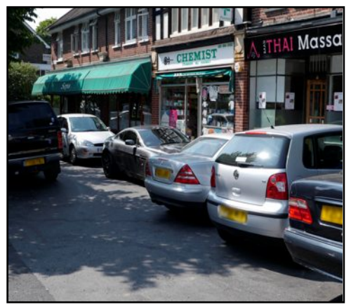
Congestion at Wellesley Parade

proposed by residents. They include one-way streets, mini-roundabouts, improved markings at junctions, clearer signage, extensions to the CPZ and an area-wide 20 mph limit. The causes and their solutions are not necessarily obvious to those who are not professional traffic planners. And, in many cases, proposals can contentious, sometimes he favouring some parties to the detriment of others. Piecemeal changes merely solve a particular