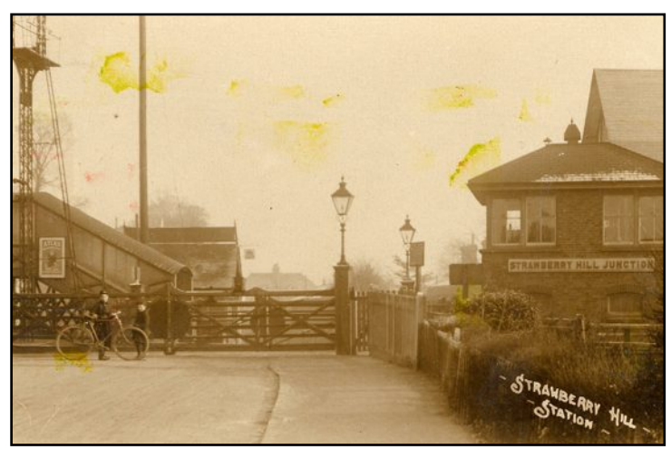
The level crossing in the early 20th century. The structure of the footbridge can be seen.

Strawberry Hill Station was opened on the 1st of December 1873. Why wasn't it thought necessary to build a station at first? Unfortunately, it will probably never be possible for an authoritative answer to be given, for the one certain source of information - the directors' minutes of the London and South Western Railway for the relevant decade - was destroyed during the Blitz on London by a fire at Waterloo Station.