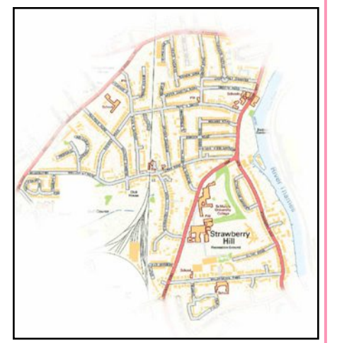
The restored boundaries as shown on the Council's website

We're happy that the Council has responded positively to our complaints. As one resident put it: "Thanks to ... the SHRA Committee for all your work on getting the Council to accept the residents' views on boundaries. This is a great result and shows that individuals can make their voices heard when galvanised into action."