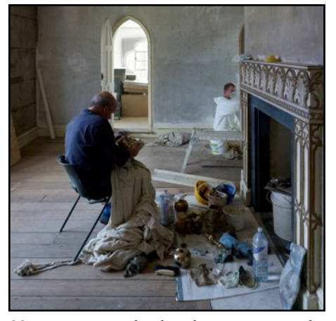
Minute attention to detail produces stunning results

In restoring the Tribune it was discovered that there had been three layers in the window embrasures: a plain glass window, a painted glass panel and the shutters. The glass panels can now be returned.