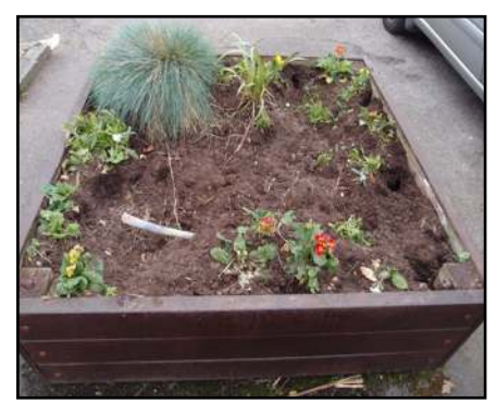
One of the denuded planters at the entrance to MKG 3000

On Christmas Eve, thieves removed a large marguerite bush, grasses and flax plants from the planters at the entrance to MKG 3000. At some time in the second week of January, four evergreen trees were removed from the planter outside Sopa.