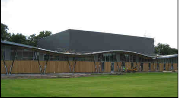
The new sports hall

well as providing cricket lanes. These new facilities, along with the existing ones, will be