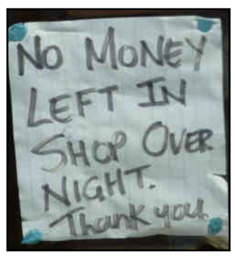
Following police advice, this notice in the window of Peggy's Pantry seeks to deter burglars.

Our PCSOs have given crime prevention advice to all the businesses in this location with regard to not leaving money in the tills overnight and if possible making the empty till visible from the street. We have also suggested that shopkeepers put up signage stating that no money is left on the premises overnight.