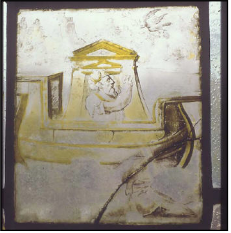
The Noah window at Strawberry Hill

A donation of £500 has been made by SHRA to the Strawberry Hill Trust to help preserve a rare piece of 16th century Flemish glass. Depicting Noah's Ark (above), the preservation is part of the £8 million restoration programme which began this year and concludes in 2010. The donation was made at the final public event to be held in the house before it closed for the work to begin.