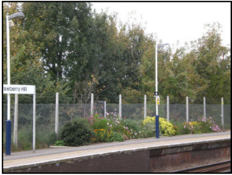
The garden on Platform 1 at the station

<sup>c</sup>The other day when I was working on the flower bed, a train driver opened his window and said how lovely it looked". Strawberry Hill commuters and SHRA agree.