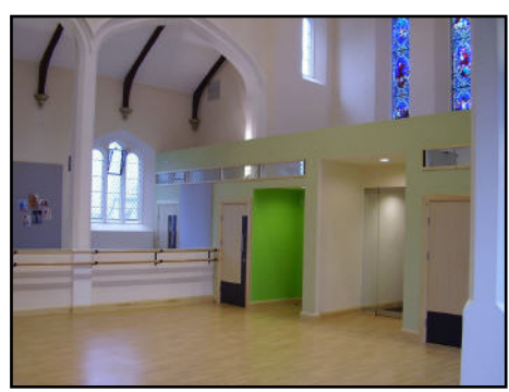
The new Green Room at Holy Trinity Church

The Green Room is the meeting room inside the main entrance of Holy Trinity Church. The Room is well known locally as a polling station at election times, and it throws its doors open for events such as the HANDS charities fair on Twickenham Green.