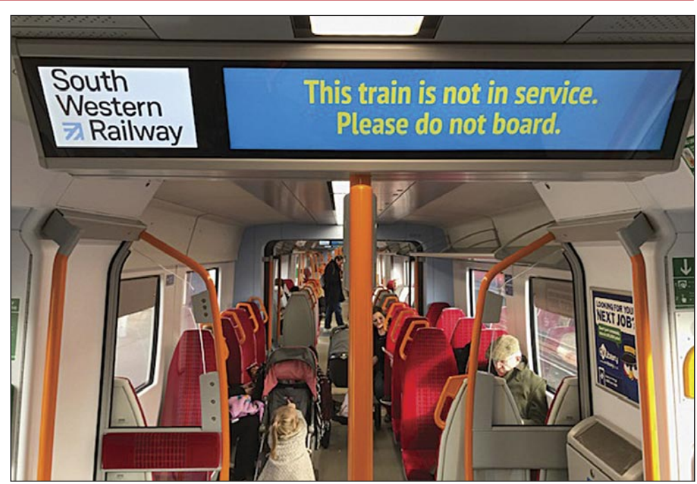
The onboard signs are often wrong, although frequently ignored, as this photo, taken on a train to Waterloo, shows.