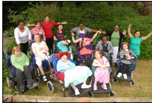
Residents and staff at Roy Kinnear House

Because of the young people's complex needs, a large team of nurses and support workers is employed. The aim is to give the residents the best possible care and quality of life and this means getting out and about in the community and doing all the usual things 20- and 30-somethings are into!