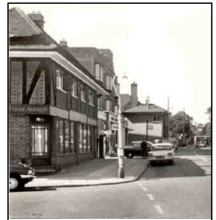
Tower Road in the 1960s, with the estate agent on the corner and the car hire's petrol pump behind