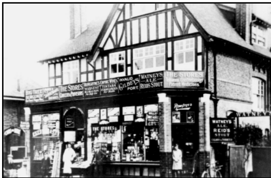
The Stores in the 1930s. Most of the advertisements seem to be for alcohol

Until the 1920s there was a limited need for shops as much fresh produce came from local market gardens and a dairy farm in Waldegrave Road, delivered as required. However the rapid development of housing between 1900 and 1930 created a need for more local businesses. In 1930, the bootmaker was joined by a confectioner, a ladies costumier (or draper), and shortly after, by a coal merchant (where the off-licence, McDowells and the dentist's surgery, respectively, are now). The following year the opposite side of Tower Road was developed and a fruiterer, a baker, a car-hire business, Strawberry Hill Cars, opened on the site of the present Lexington Court. A grocer and a Barclays Bank