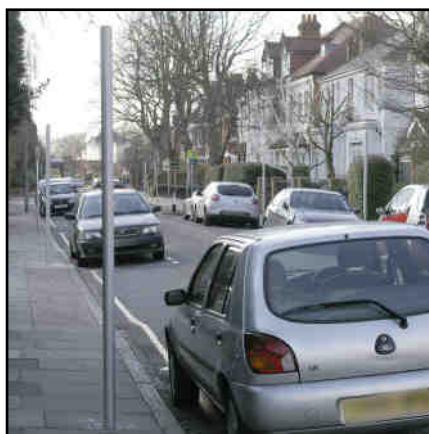
Some of the crop of new poles in Popes Grove

Residents complain that the road is already inflicted with yellow lines, speed bumps, kerb build outs and a chicane under the railway bridge. They add that while they were consulted about the CPZ, there was no consultation about the parking display poles.