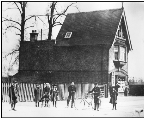
The Post Office in the early 20th century. The two boys with the bicycle are telegraph boys

Records for the war and the years following are sparse, but it is known that Rochester House was built on the bomb-damaged site in 1953 and a butcher (Framptons, then Lorie Meats, closed in 1989) opened where the Hill Dry Cleaners now stands, followed shortly next door by a greengrocer, Quality Corner, in the shop now occupied by Kyzan, the