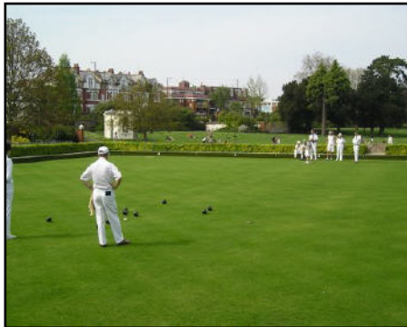
A Ladies versus Gentlemen match in April 2008

Free equipment will be provided and bowls coaches will be on hand to give guidance. All you need is flat-soled shoes to avoid damaging the green. Free refreshments will also be provided.